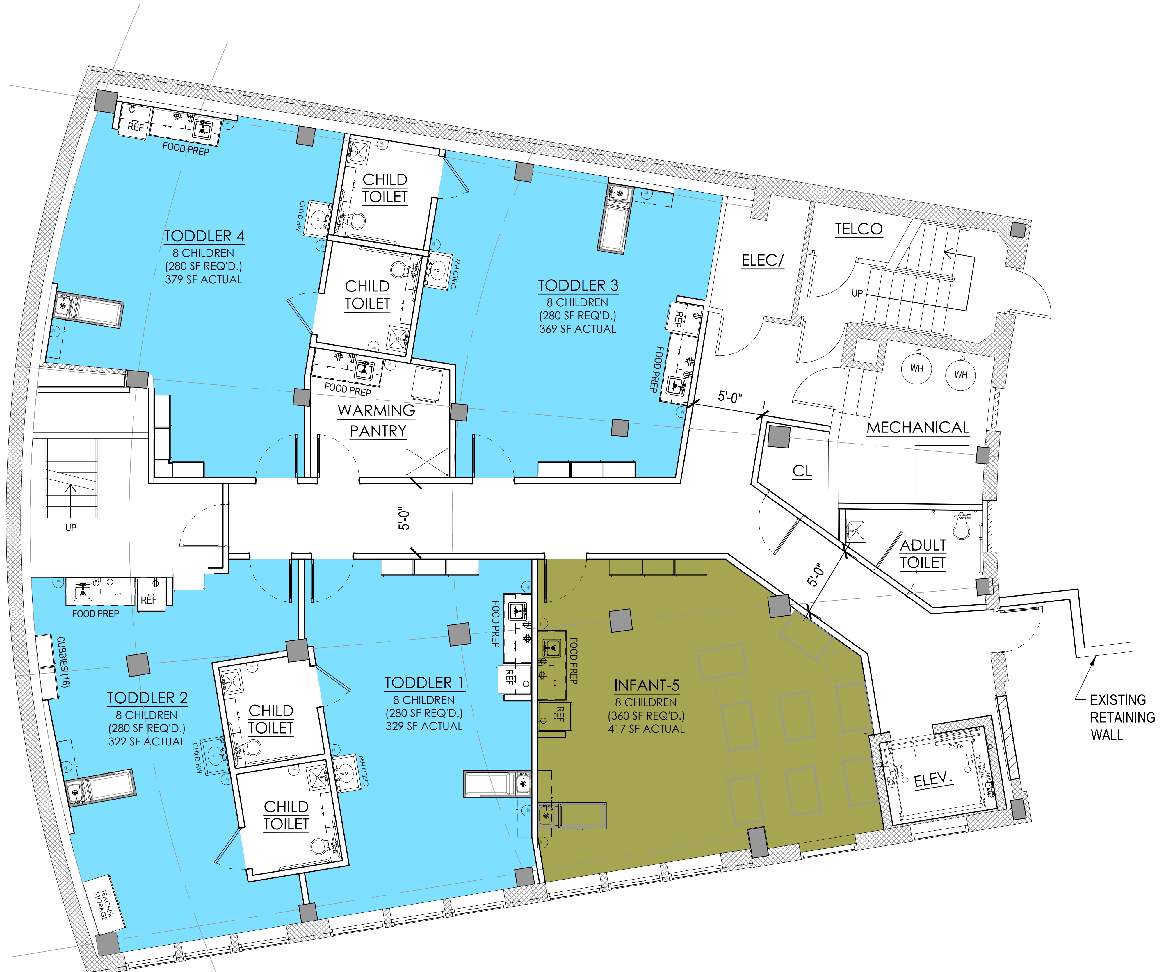
FIT PLAN C SCALE: NTS

NOTE: FIXTURES ARE EXCLUDED FROM INDOOR AREA CALCULATIONS FOR CLASSROOMS THE PLANS SHOWN ARE PRELIMINARY AND CONCEPTUAL IN NATURE FOR DISCUSSION PURPOSES ONLY. THESE PLANS HAVE NOT BEEN EVALUATED FOR COMPLIANCE WITH BUILDING CODE. ADDITIONAL INFORMATION WILL BE NEEDED TO DETERMINE FULL COMPLIANCE WHICH MAY ALTER THE PLANS OR FEASIBILITY OF THE LAYOUT.